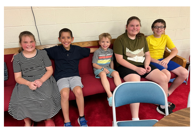
Children enjoying one another's company after potluck.

I would ask you to pray for these new or resumed ministries, that they be a pleasing offering to our Lord, and that he would prosper these ministries to bless many more lives. Thank you for all of the support you have given your church in these tumultuous years. Let us continue forward in faith together with confidence in our shared spiritual heritage.